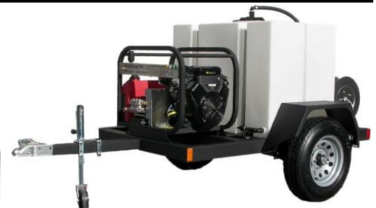
Optional transport trailer or tank skids include inlet hose, stainless inlet and high pressure hose reels, bulk water tank and is factory assembled.