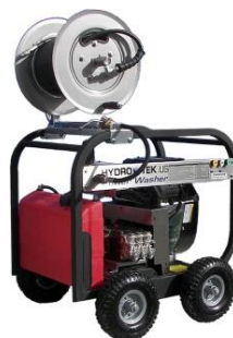
Optional wheel kit and sewer jetting kit