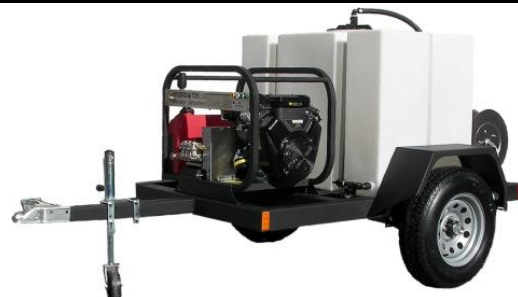
Optional transport trailer or tank skids include inlet hose, stainless inlet and high pressure hose reels, bulk water tank and is factory assembled.