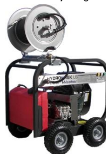
Optional wheel kit and sewer jetting kit