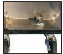
The under-deck spot remover uses a "six-shooter" nozzle to blast away gum or paint.