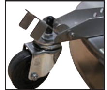
Caster pivot lock allows the operator to choose to lock casters for use in straight lines or unlock for cleaning side-to-side.