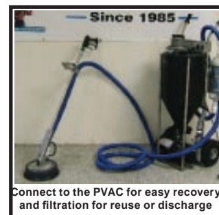
Connect to the PVAC for easy recovery and filtration for reuse or discharge

For additional Mobile Wastewater Solutions, ask your dealer for information on the Hydro Vacuum® product line.