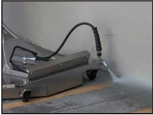
An onboard edging tool cleans close to planters, columns, and walls or use the water broom to rinse a large area