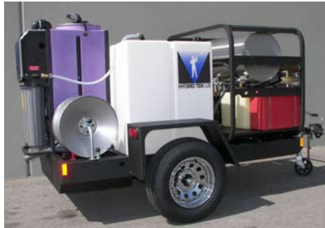
AZV is factory plumbed and installed when ordered on a Hydro Tek ProTowWash® trailer