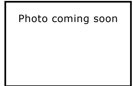
Whether you're a professional auto detailer, building service contractor or just need to recover wastewater but also have a need for a high powered dry shop/detail vacuum, simply add the dry filter option to your RPV.