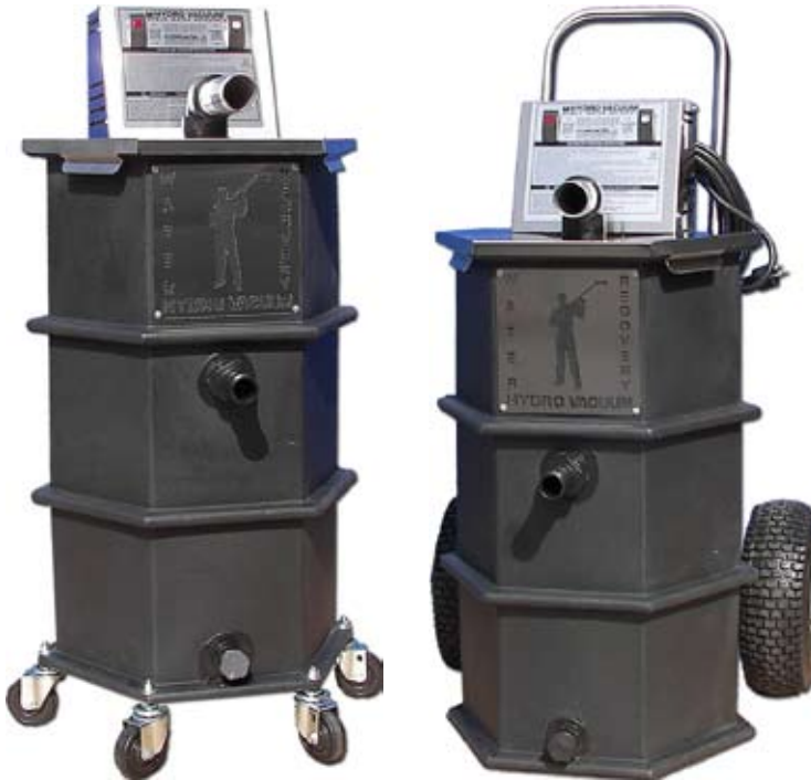
Roll the RPV near your recovery site by choosing one of the wheel kit options for indoor or outdoor use.