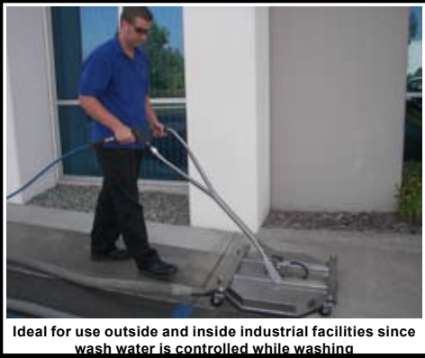
Ideal for use outside and inside industrial facilities since wash water is controlled while washing