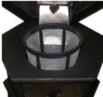
Lift out basket strains out large debris to protect your pump

RPV50E1: 50 gpm - 115v, 20 amp or 5500w generator