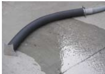
Using vacuum tools such as a vacuum arch (above) or a Twister Vacuum (below) will increase your efficiency