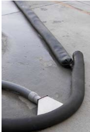
Sand Tube Berm, available in 2' (ZMAT2) & 10' (ZMAT6)