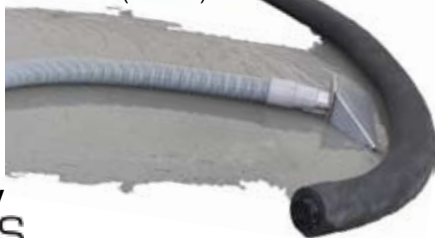
6' Foam Rubber Sand Berm (ZMAT7)

The Hydro Vacuum Arch is an easy way to recover water. Lay it on the ground, connect a vacuum source (75 - 200cfm) and it will create a vacuum wall along the bottom edge to suck up the water. Suitable for concrete or asphalt with a 5' wide even surface. Hydro Vacuum Arch (ATP40)