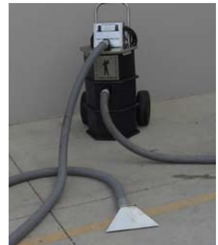
Shown with optional vacuum scupper and 2" vacuum hose and discharge hose

Vacuum recovery & pump out tests calculated using 25' of 2" vacuum hose and 50' of 2" discharge hose.